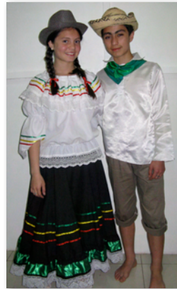
AMO students from Bogota