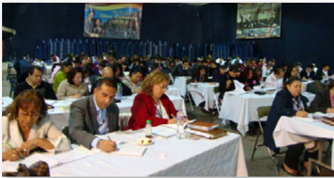
AMO® Apprenticeship at Iglesia Manantial de Vida