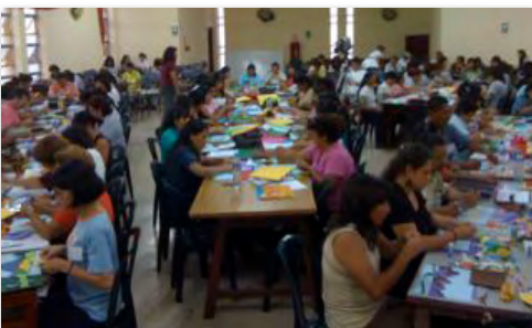
Christian and Missionary Alliance AMO® Apprenticeship